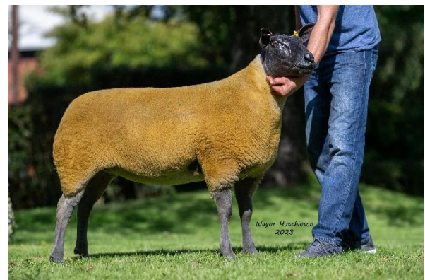
SKYE BLEU Wynter 3200gns