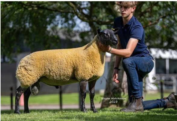
MAXIMUM Youngblood 4000gns

Another exceptional year for the Bleu including these Carlisle highlights: